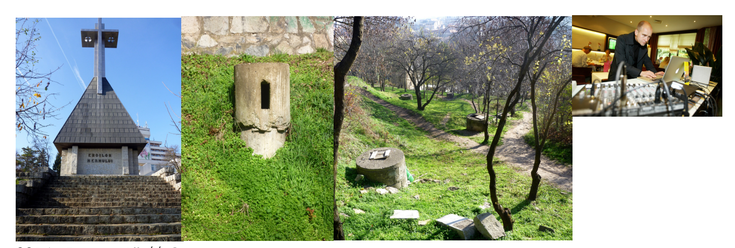
2014 - Fortress Hill //: Cetatuia an intermedia sound art project in public space

sound installations at Cetatuia Park, at the Hotel Belvedere and at the monument of the citadelle at Cluj- Napoca / Rumania - a project on behalf of the German Goethe Institut and the city of Cluj-Napoca further information: www.soniq-id.net/2014/02/12/fortress-hill-ceta-t-uia/