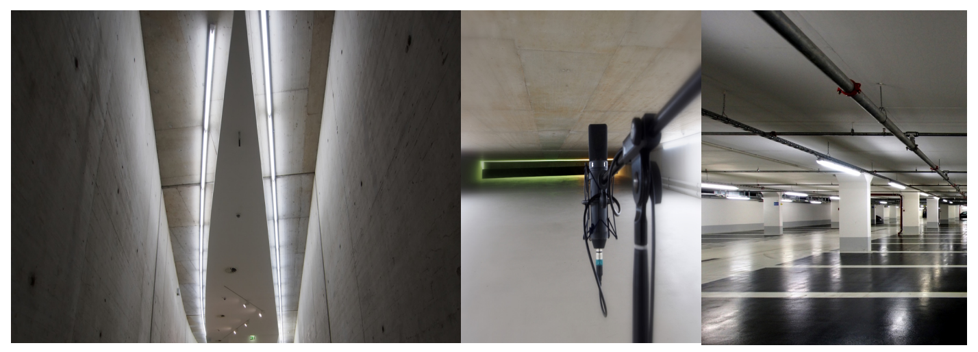
2013- Kunsthalle Düsseldorf -sonic states. sound architectures – interactions & conditions Intermedia sound art exhibition at KIT – Kunst im Tunnel together with Bojan Vuletic. further information and video documentation: