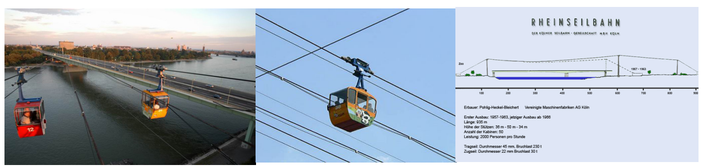
dreiklangreise - Installation at the Cologne Rhein cable railway during the 50th anniversary A project on behalf of the Musik - Triennale Cologne 2007 more information here: