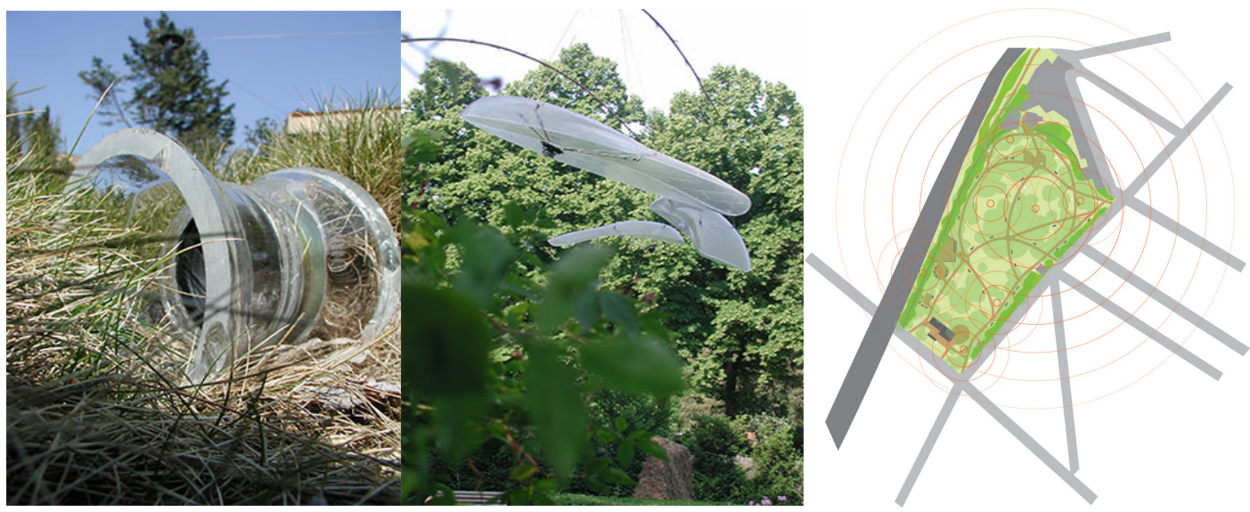
klang raum garten, COLOGNE

www.fritz-bauer-institut.de/auschwitz-prozess.htm